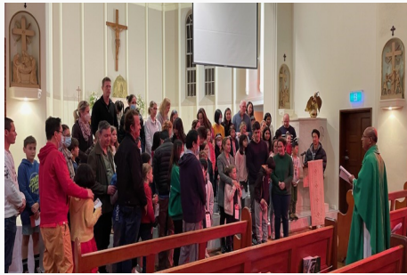
Rite of enrolment for the candidates preparing for Confirmation.