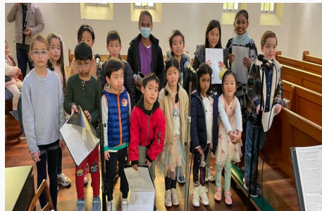
Children's choir at last Sunday's Children's

There is no place like home – but for many having a home is not a reality. The causes may be diverse, but the impact is the same – a loss of dignity and a sense of hopelessness. Thank you to our Parishes for helping us fundraise for CatholicCare's homelessness services.