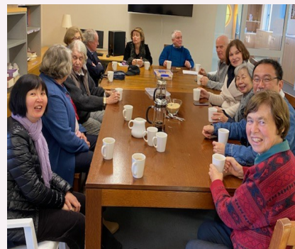
Morning tea after 8:30am Mass at Shirley Wallace Library (above the church)

*These run on the 2nd & 4th Sundays of each month up in St Brigid's Hall with the first on Sunday 11th September 2022.